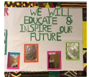
Bulletin Board displays created by 6Myette